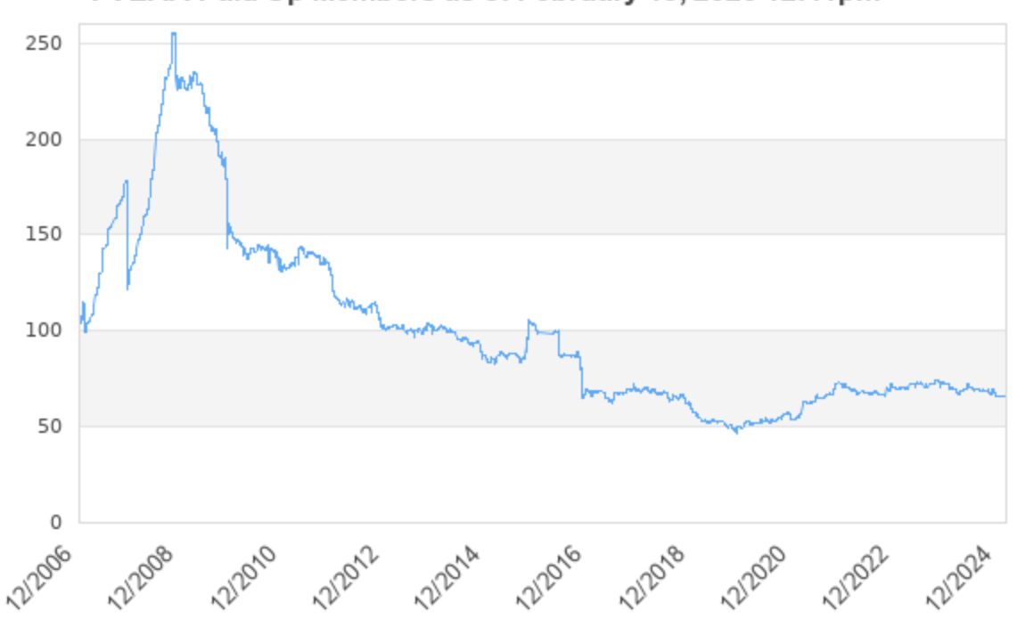
FVEAA Paid Up Members as of February 19, 2025 12:41pm

Members: Minimum: 46 on 2019-11-12, Maximum: 255 on 2008-10-28, Latest: 66 on 2025-02-19