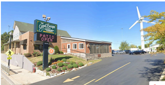
Dec. 13, 2024 Fox Valley Electric Auto Association Holiday Party at the Great Escape restaurant 9540 W Irving Park Rd. Schiller Park (wind turbine/ EV charging stations in back)