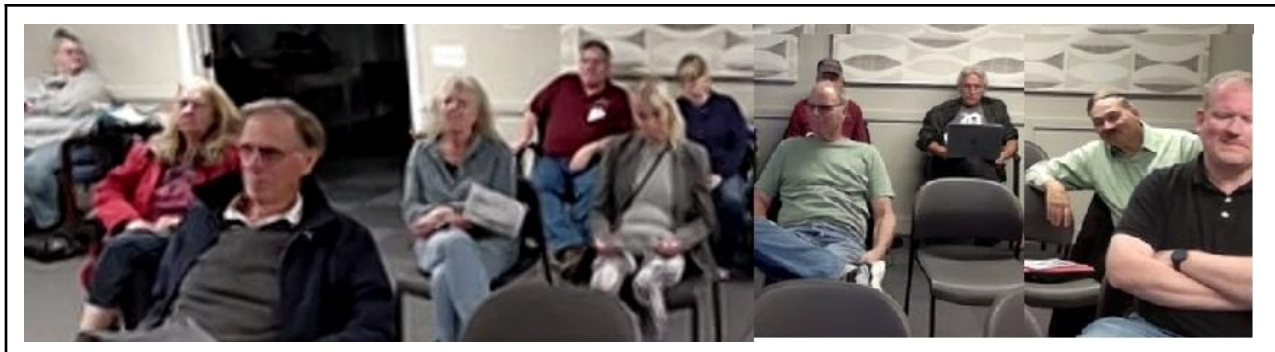
Meeting attendees at the FVEAA meeting, Unitarian Universalist Society of Geneva