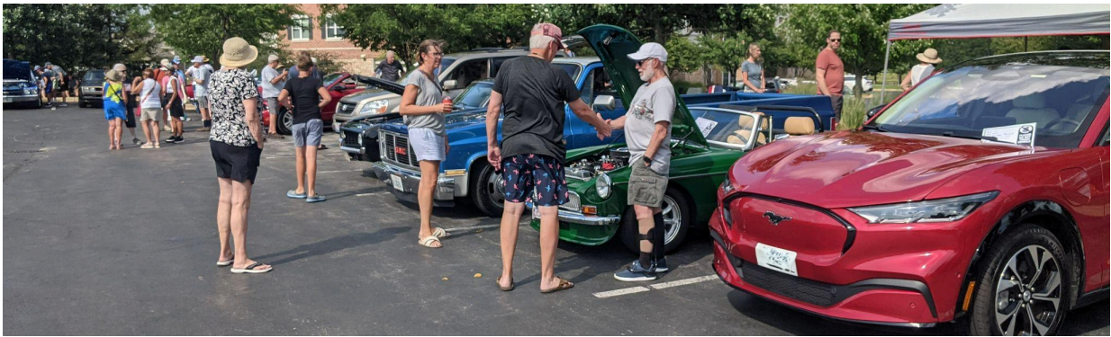
Red Ford Mustang Electric among the cars displayed at the Carillon car show