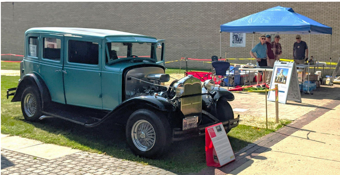
8/25/2024 At the Concours d'Elegance in Geneva, Tracey McFadden under the canopy with men from the Unitarian Universalist Society selling cold water and drinks on a VERY hot day. The team sold LOTS and lots of cold drinks! There was also a lot of interest in the Hupmobile