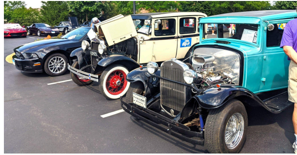
Variety of cars at the show