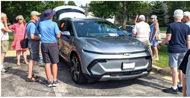
Chevy Equinox at the Carillon car show

Thanks to Tim Moore for coordinating our participation in this car show at Carillon!