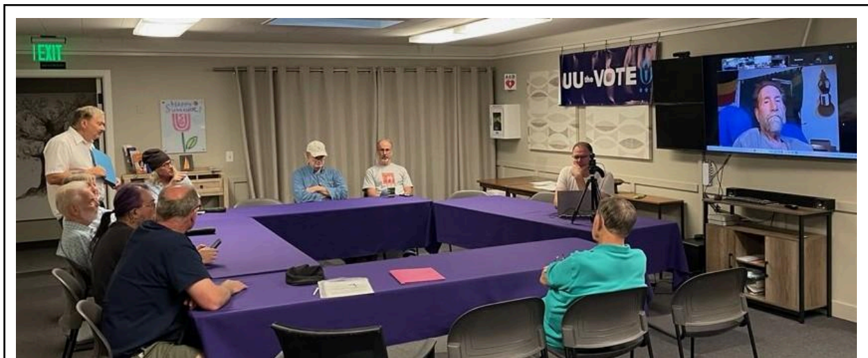
Aug. 16, 2024 FVEAA Meeting at the Unitarian Universalist Society of Geneva