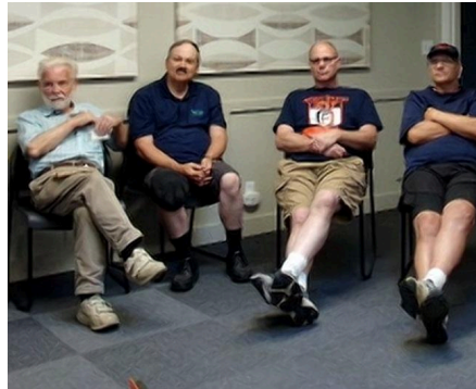
At the Unitarian location