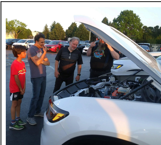
FVEAA members and friends checking out the front of the Honda EV. No frunk however.