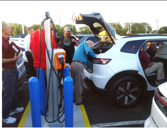
Fred uncovers the rear trunk features