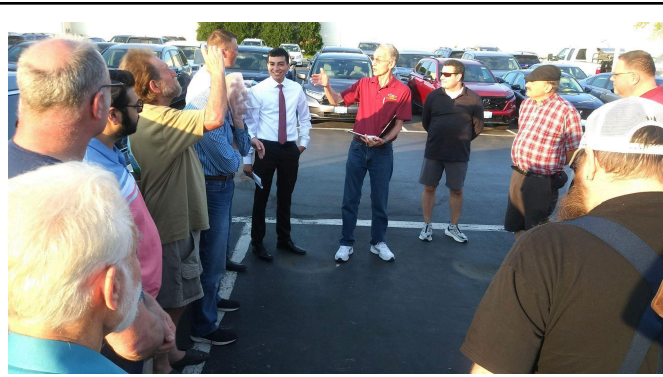
Valley Honda sales staff with the group