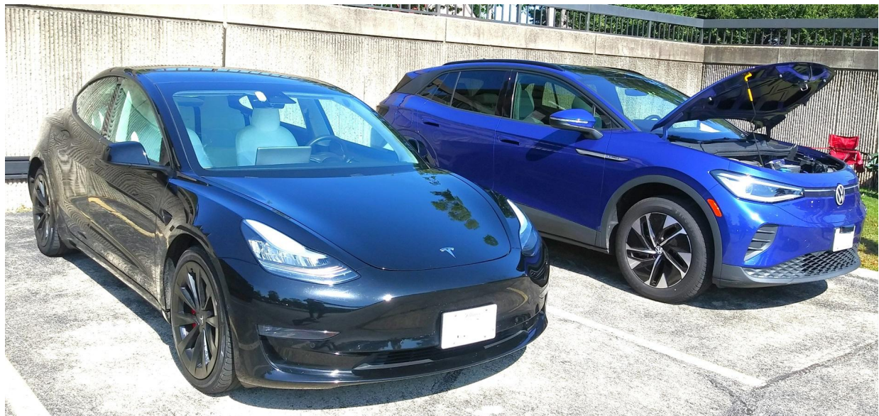
Jeff's Model 3 Tesla and Tracey's VW ID2