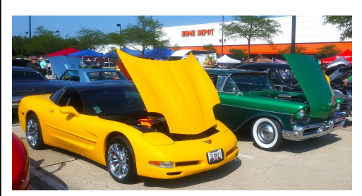
The gorgeous cool cars!