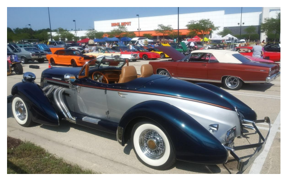
The winning car - an Auburn