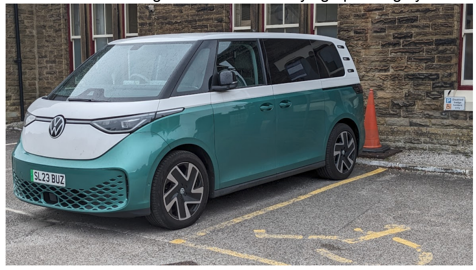
I was pleasantly surprised to see multiple charging opportunities even in the small town of Settle in Yorkshire!