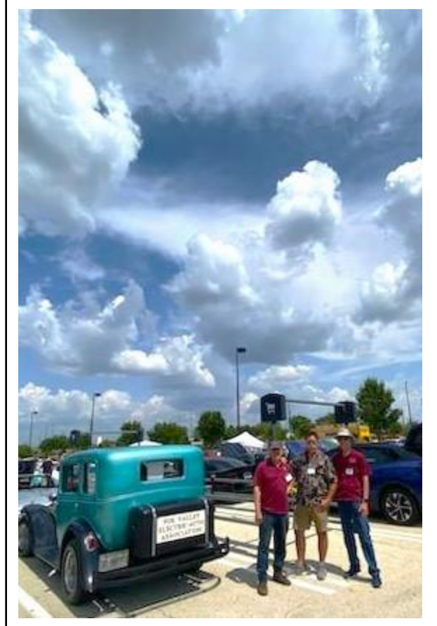
7/22 Beautiful day for a car show! Bruce, Rich and Tracey at Schaumburg car show