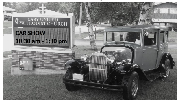
With the 1930 Plug-in-Hybrid Hupmobile plugged in getting a charge