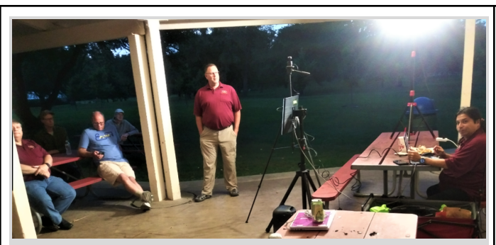
Nice Park District Pavilion in Geneva