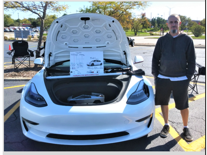
Nicely furnished Tesla Model 3!