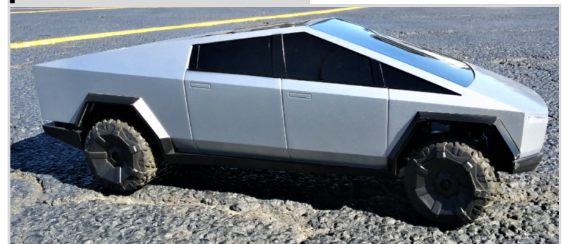
We had a Cybertruck! (well <=Teegan's remote controlled Cybertruck anyway)