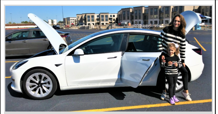
Kristen and little Gigi Bond wearing black and white outfits that match the Model 3's black and white color scheme