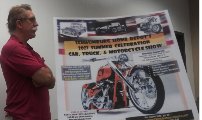
Here ye, hear ye, come one and all to the EV events this Summer!