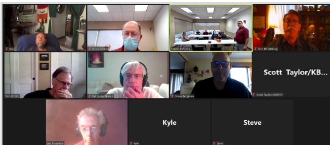
On-line meeting attendees 5/20/2022, There were another eight or so in the room at CCC