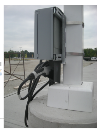
We have only had that one latch issue on the Clipper Creek since it was installed in 2014