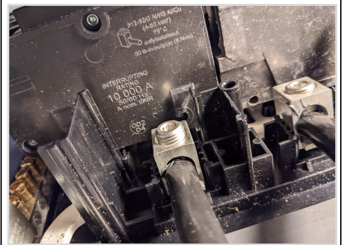
Connections on Curt's panel