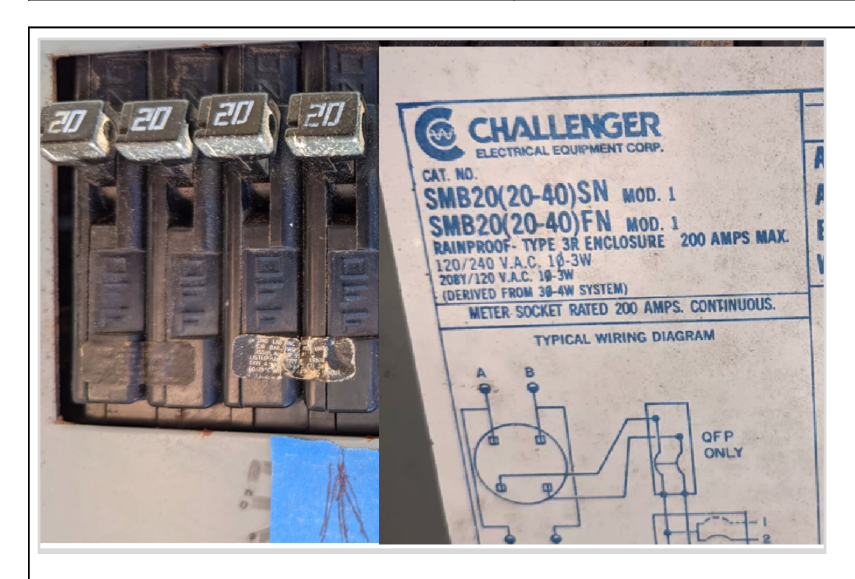
Jeff overcame challenges with the notorious Challenger breaker panel