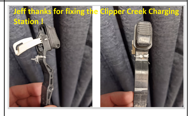
Jeff fixed the Clipper Creek charging station at CCC when the top button/latch broke. Jeff once again came to the rescue