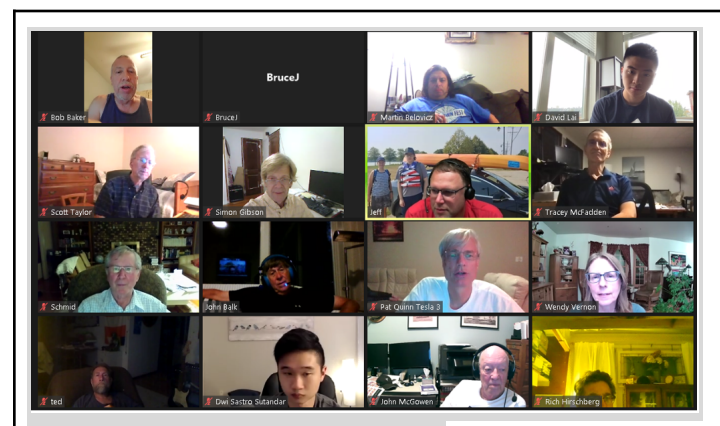
Attendees at the Sept Meeting