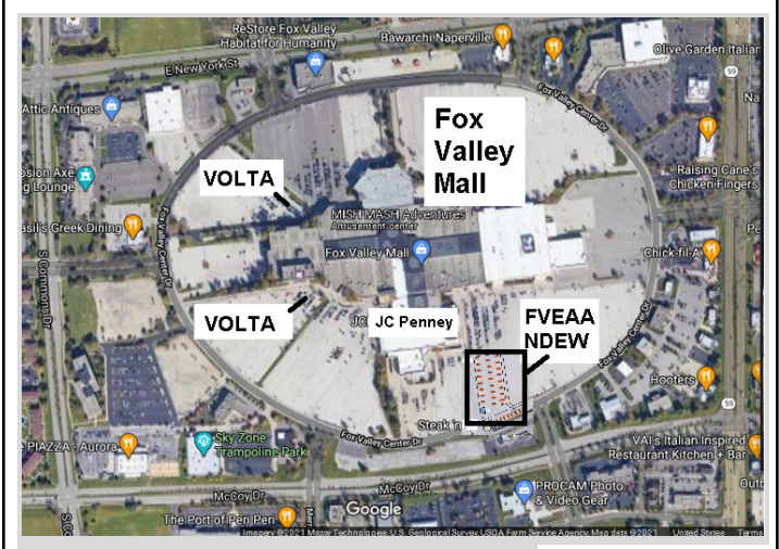
NDEW South OCT 2nd 10:30 - 3:30