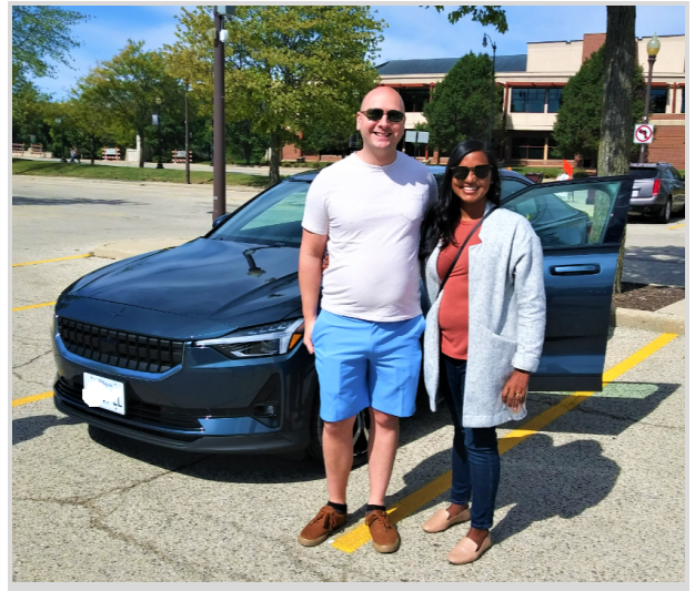
Visitors with a beautiful Polestar II