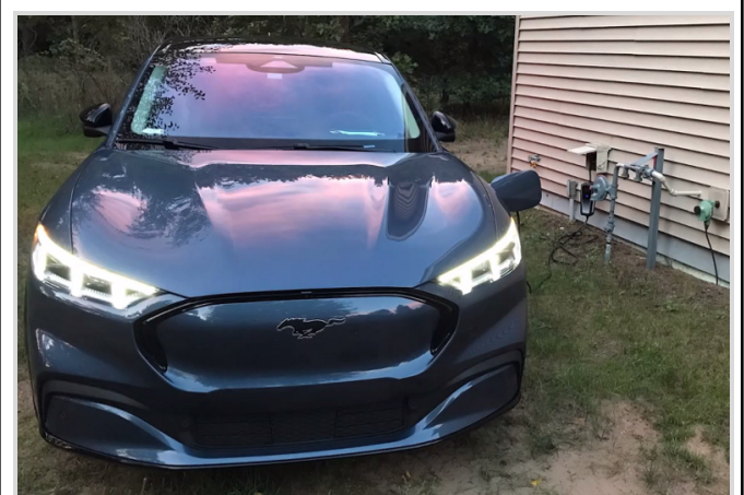
Howard Hansen leased a Ford Mache and expressed frustration with non-intuitive controls