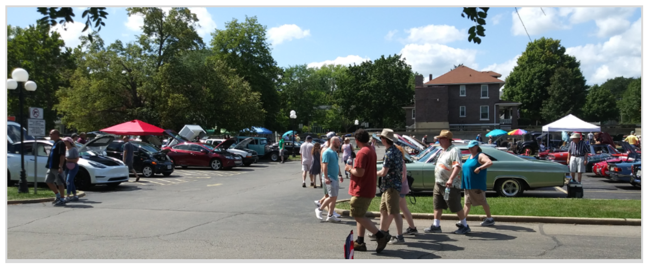
LOTS of attendees at the Geneva event. (FVEAA was over on the left) There were many hundreds of cars on display of all kinds