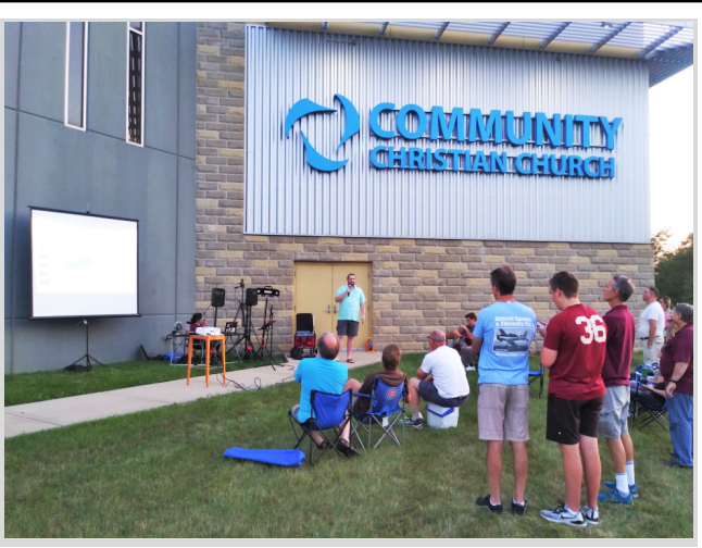
August 20th was A beautiful night for the hybrid outdoor / zoom FVEAA meeting