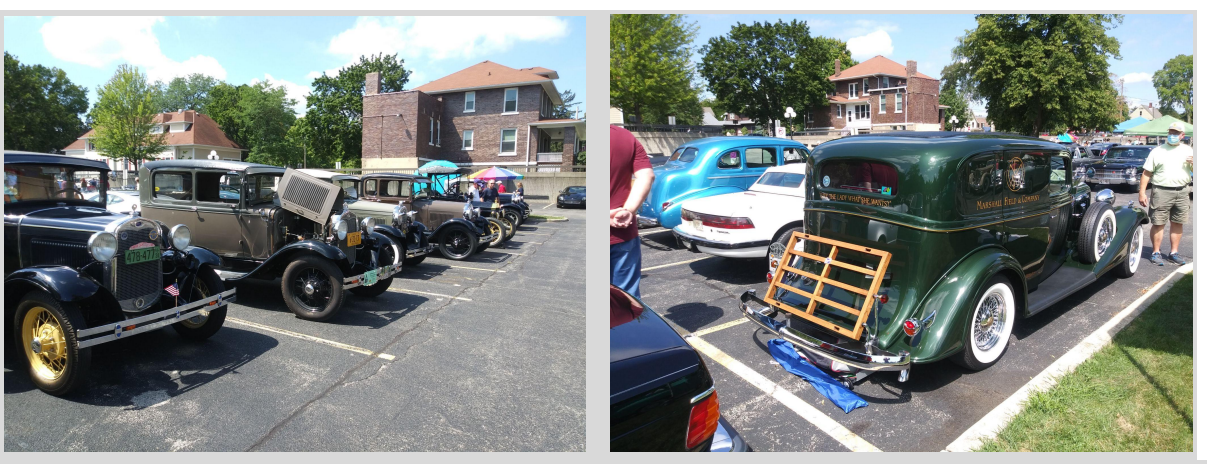
And there were all kinds of cars, hot rods, rare cars, luxury cars at the Concours d'elegance