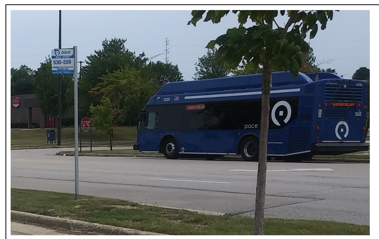
Standing right where the NDEW event is going to be held at Fox Valley Mall... at the PACE bus stop