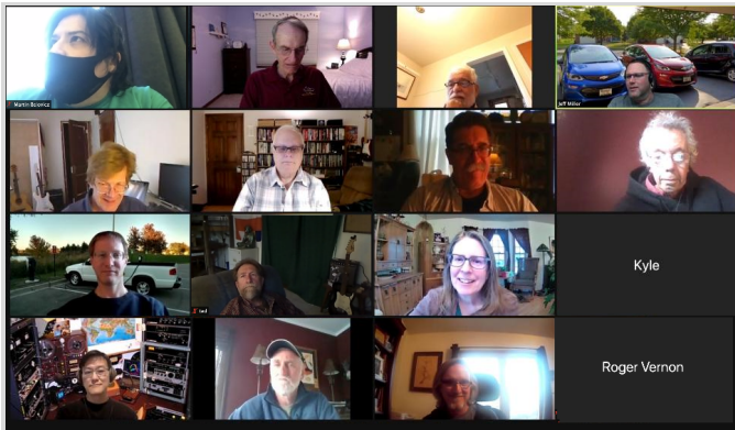
Attendees at the 4/16/2021 meeting