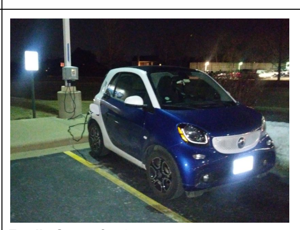
Fred's Smart for 2