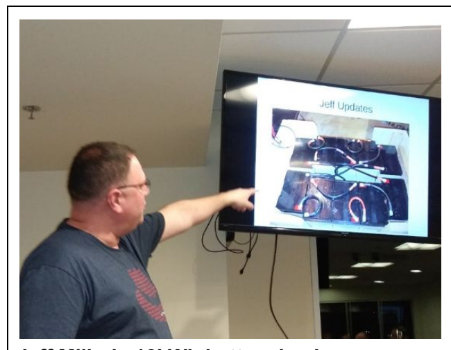
Jeff Miller's 12kWh battery backup