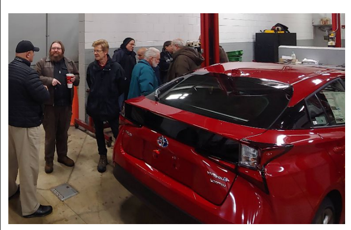
January 17, 2020 at Elmhurst Toyota