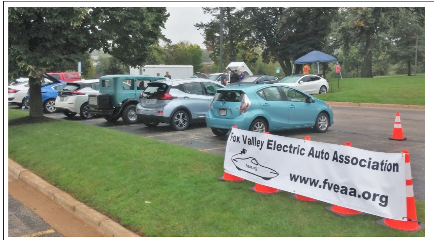
FVEAA at the Aurora Green Fest at the Prisco Community Center 150 West Illinois Ave. in Aurora