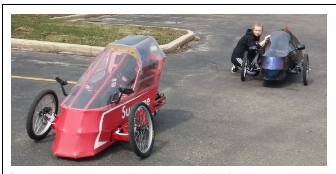
Preparing to race in the parking lot