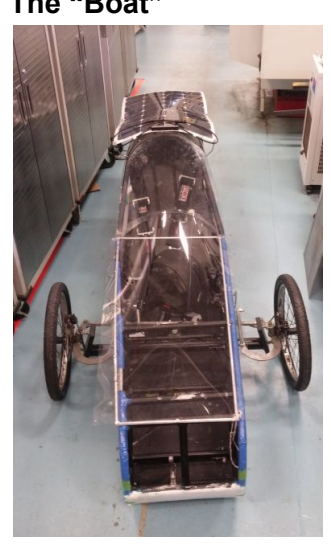
with solar panels too