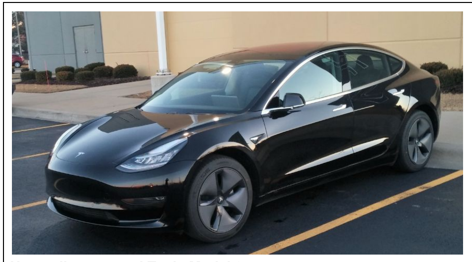
Howard's very cool Tesla Model 3