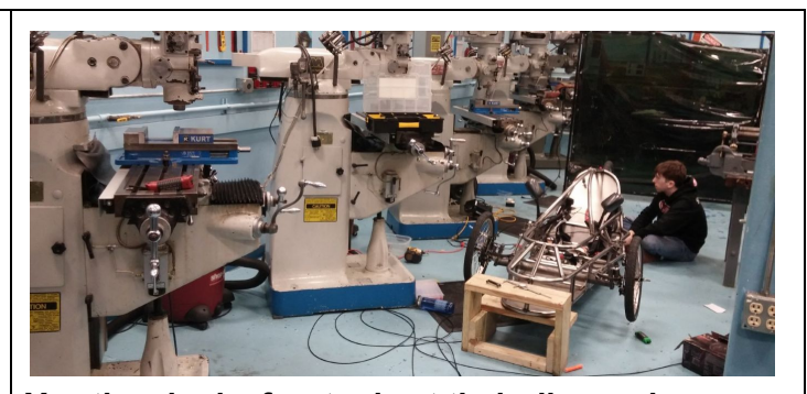
Yes they had a few tools at their disposal...