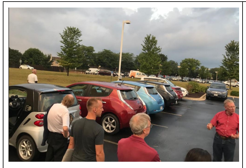
Seven of the plug-in vehicles at the meeting