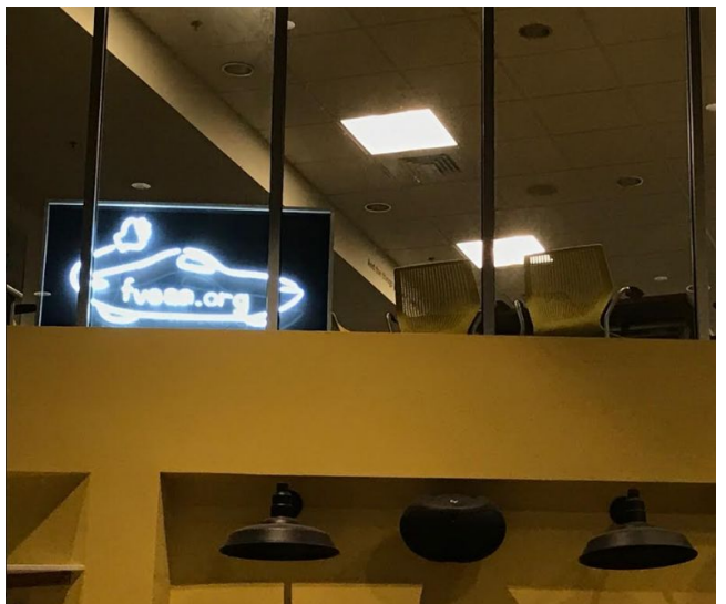
The FVEAA neon sign greets attendees.