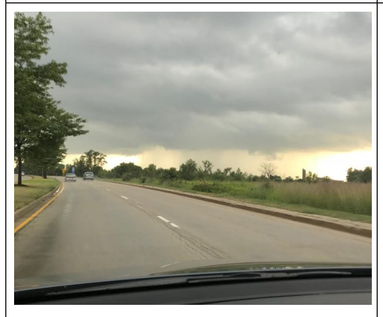
I was admittedly nervous our EV show-and-tell might get rained out as I saw rain as I drove to Naperville, but the weather was perfect.