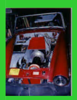
Acterra EV Conversion Project