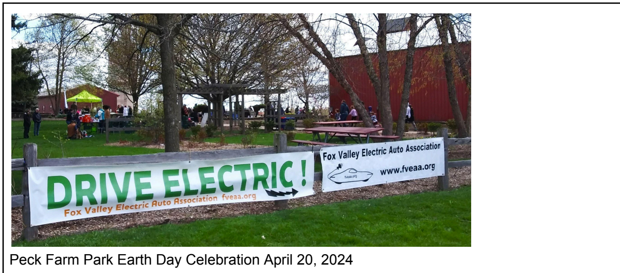
Peck Farm Park Earth Day Celebration April 20, 2024