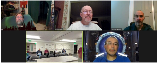
Meeting Attendees - on line and on site in Geneva, IL