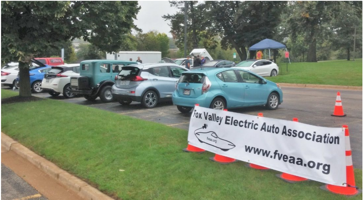
FVEAA at the Aurora Green Fest at the Prisco Community Center 150 West Illinois Ave. in Aurora