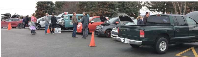
April 20, 2018 Earth Day at Peck Farm Park in Geneva was well attended by EVerS!