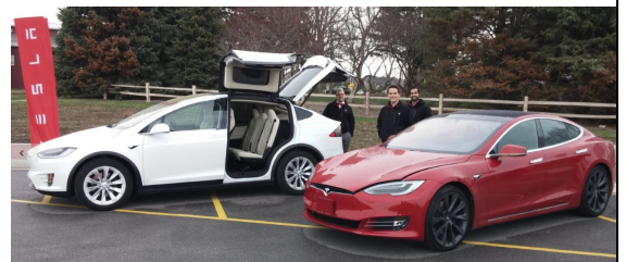
Tesla's were at Peck Farm park and also at the Naperville Earth Day event on 4/21