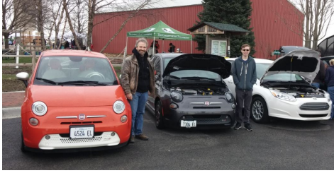
Trio of Fiat 500e electric cars at Peck Farm Park!