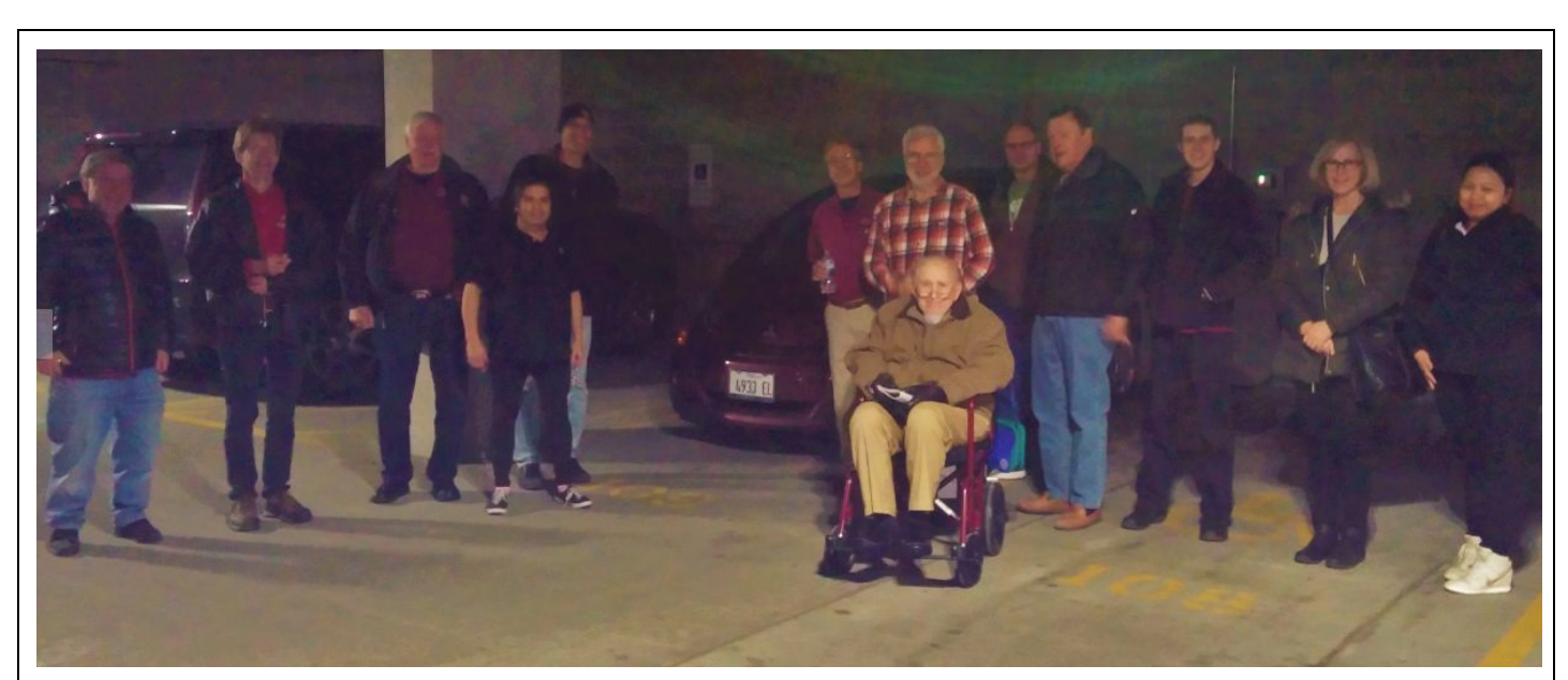
The group taking a tour of charging stations at One Arlington Apartments