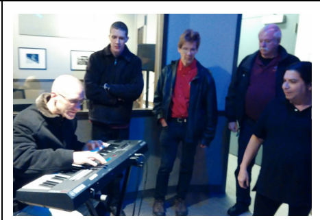
Having fun in the recording studio