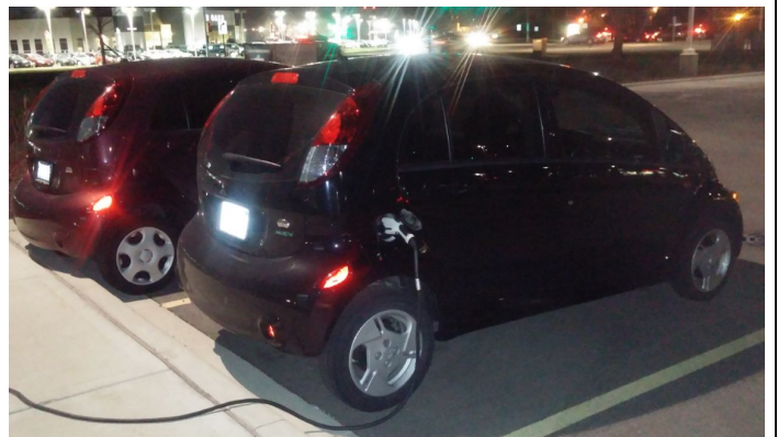
Dual Mitsubishi iMievs