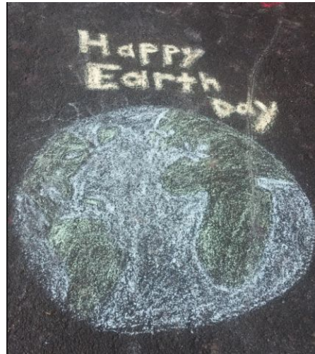
Sidewalk art at the Peck Farm Park in Geneva sponsored by the Geneva Park District and Northern Illinois Food Bank