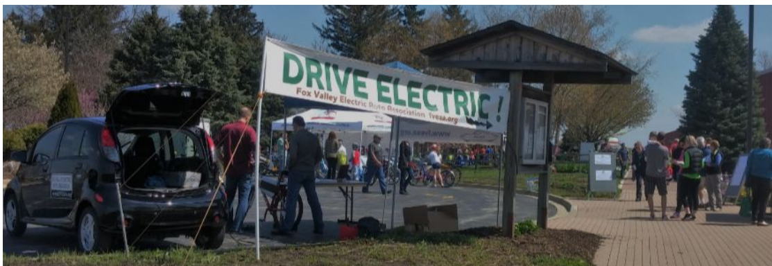
Earth Day 4/23