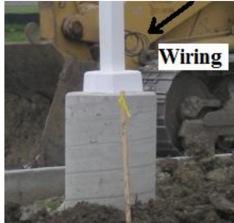
Wiring, pulled and ready for the EVSE