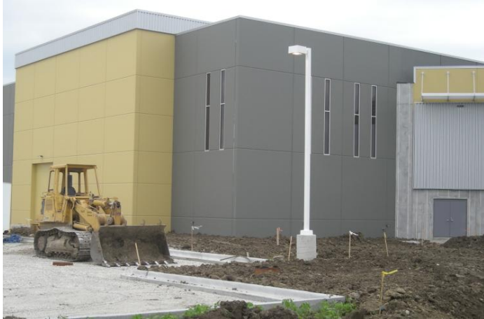
The light pole and wiring was installed on June 13 at CCC. Next step, install the EVSE

The light pole was finally installed at Community Christian Church in the new parking lot on 6/13. The board finalized the paperwork and now it's just a matter of a few weeks and the Clipper Creek CS-40 - 208/240V 30A Single Level 2 charging station will be installed.