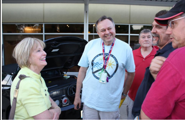
Congresswoman Judy Biggert talks about electric vehicles